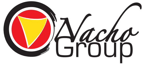
Visual Arts & Design